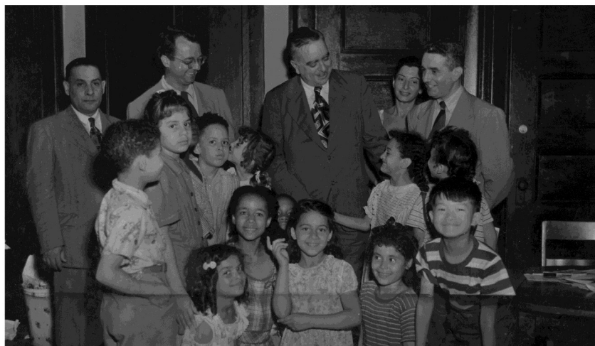
Governor Piñero and other officials share with a group of children at the Manhattanville Community Center in New York. (July 1948).

Our society is once again faced with the reality of large-scale migratory movements and we are challenged to analyze and understand this dramatic situation. We invite our friends to share with us in this opportunity to discuss this process and that implications it holds for all.