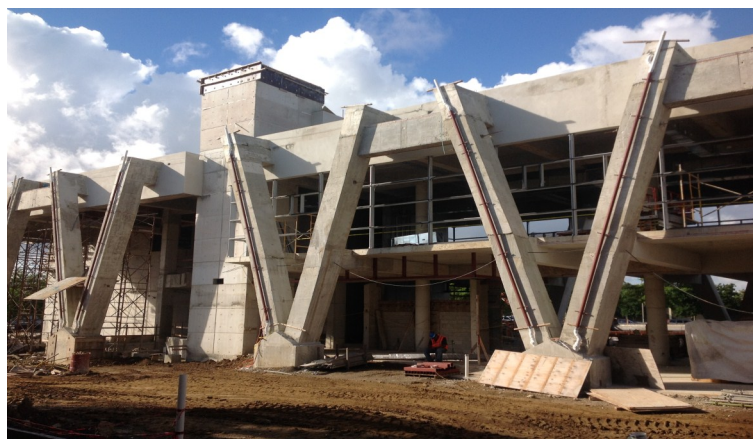
A view of the construction site, December 2014