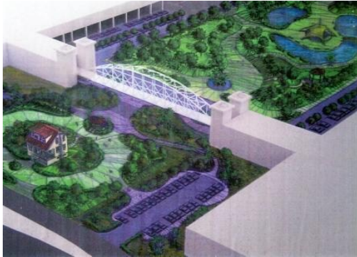
Artist's rendering of how the Piñero House Museum would be affected by the proposed construction.