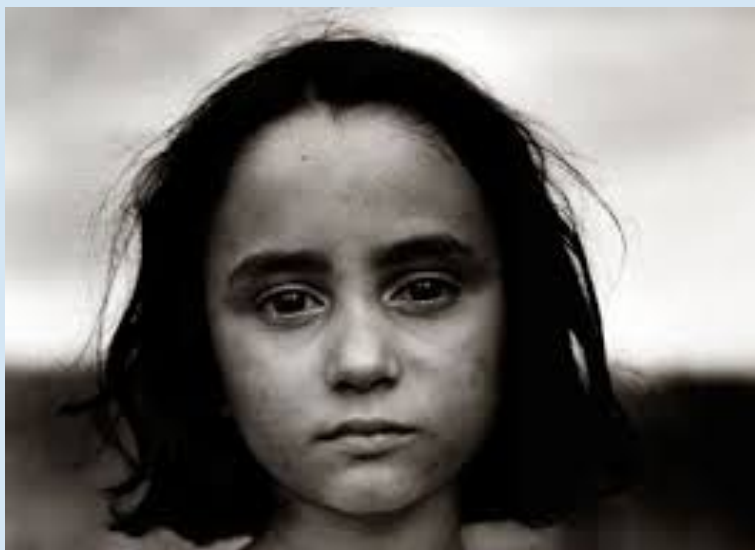
"Farmer's daughter, near Caguas", 1941.