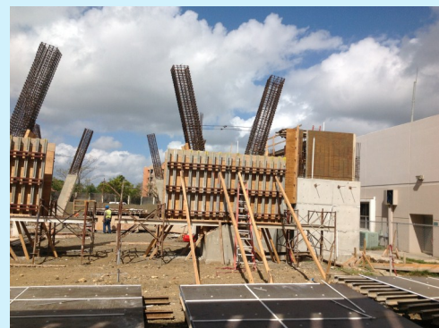
Views of the construction of the future Piñero Library