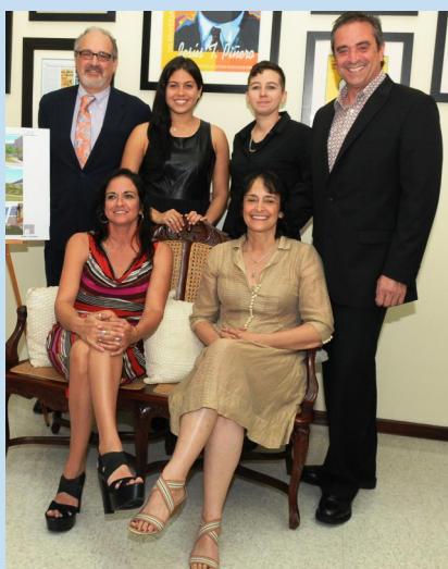
We received a visit from the grandchildren and great granddaughters of Governor Piñero.