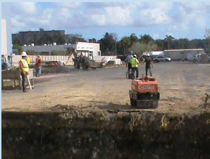
Work begins in the parking area behind UNE for the Piñero Library construction project. February 4, 2014