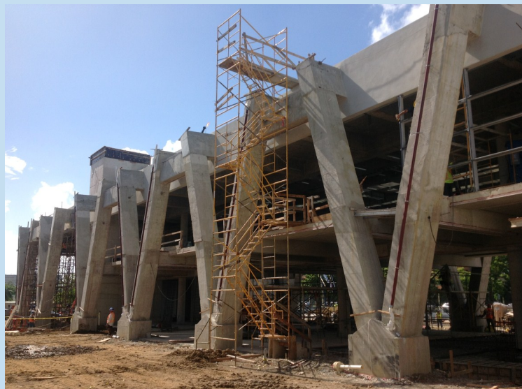
The future Piñero Library takes shape. November 21, 2014